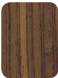
Sublime Walnut Sandblasted