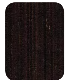
Volterra Rigato Gloss