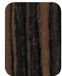
Tribal Macassar Gloss