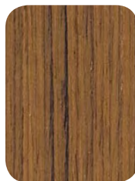
Urbane Teak Sandblasted