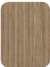
Firenze Rigato Sandblasted