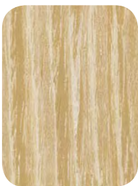
Chalked Oak Sandblasted