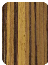
Giallo Zebrano Sandblasted