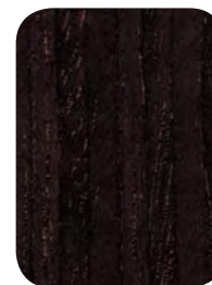
Luxe Ebony Sandblasted