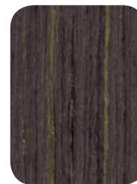
Allure Oak Sandblasted